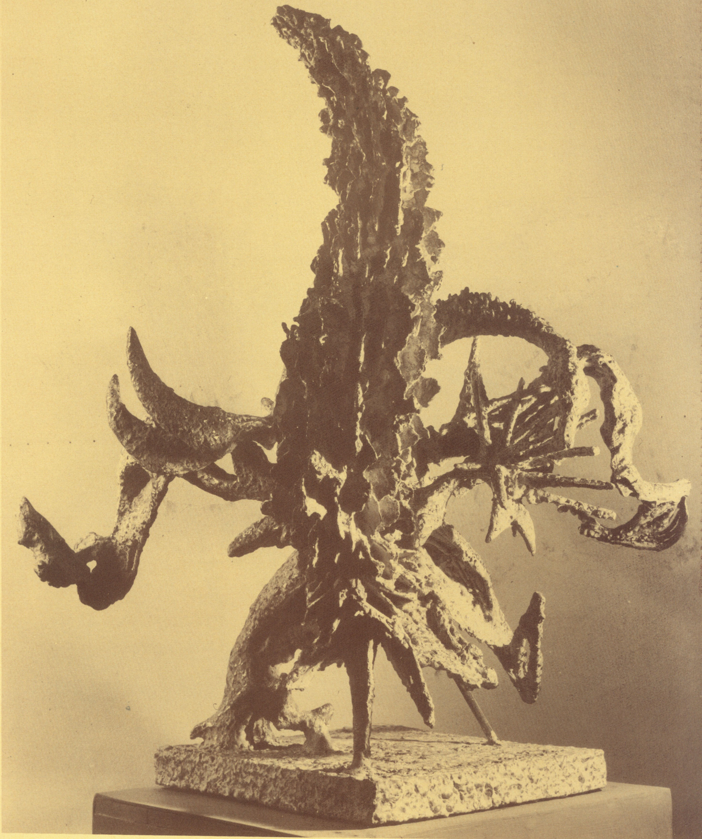
Spectre of Kitty Hawk